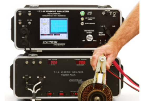
iTIG and Power Pack with ATF-11

The FS-01 is a Foot Switch used to energize the iTIG and start the test instead of using the Function Switch on the front panel of the iTIG.