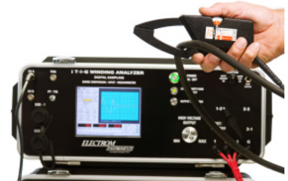
iTIG with Rotor Bar Clamp